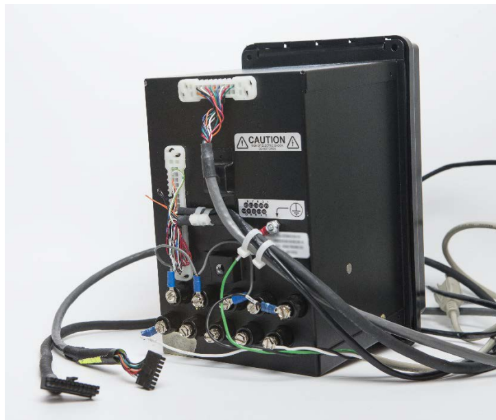
Figure 1 Typical draw-out meter—installer must add external terminal blocks/connectors

The draw-out switchboard case shown in Figure 1 is an unnecessary $800 option because the SEL-735 includes built-in terminal blocks for I/O and an auxiliary power supply, as shown in Figure 2.