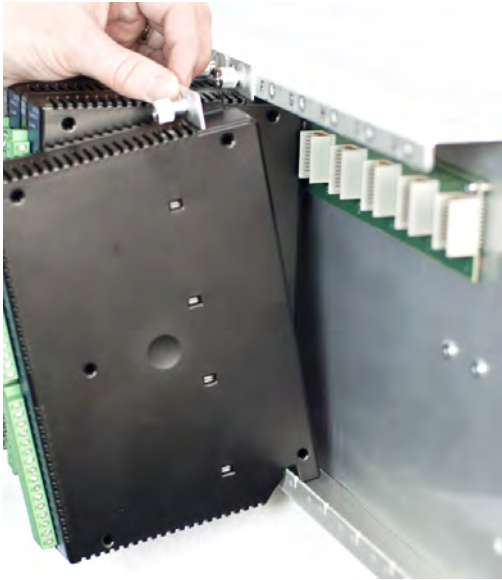
Figure 3 Proper Module Placement

Next, carefully rotate the module into the chassis, making sure that the alignment tab fits into the corresponding slot at the top of the chassis (refer to Figure 4 ). Finally, press the module firmly into the chassis and tighten the chassis retaining screw.