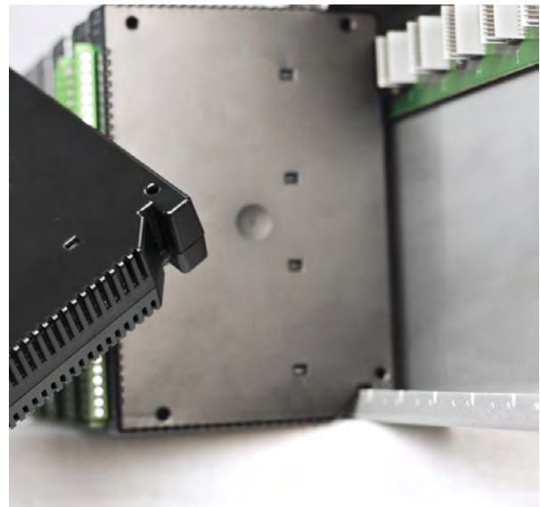
Figure 2 Notch for Module Alignment

Each SEL-2242 chassis/backplane has four or ten slots, labeled A-J. Slots B-J support the SEL-2245-2 modules.